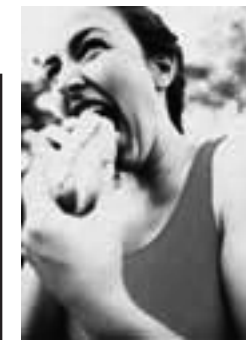
Located at 6th & Lombard for almost 100 years across from Starr Garden.